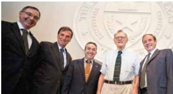
Dr. Goodenough, second from right, and UT Vice President for Research Dr. Juan Sanchez, right, join Hydro-Quebec representatives in announcing a patent partnership.

“We have to understand the moral principles that govern life as well as we have to understand the physical principles,” he said.