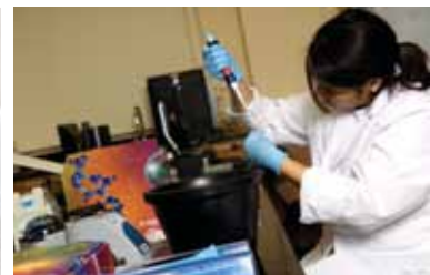
Students in the Freshman Research Initiative conduct real-world research under the guidance of doctorate-level scientists.

Health Science Center Institute of Cancer Research, and apply for the Fulbright.