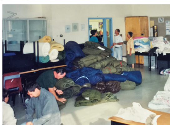
▲ Close to 40 planes landed at the Gander airport on 9/11.